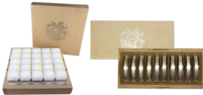
^ Masterbox with tubes 20 coins per tubes for ¼ oz, ½ oz, 1 oz

Each unit is packed in a sturdy wooden Masterbox with silver print on the lid.